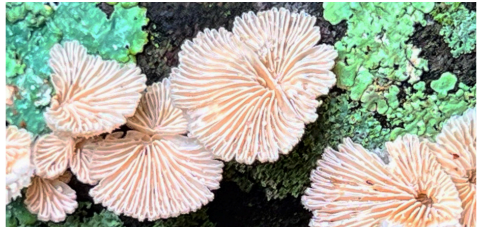
Splitgill mushroom, a commonly found species of mushroom in Maryland