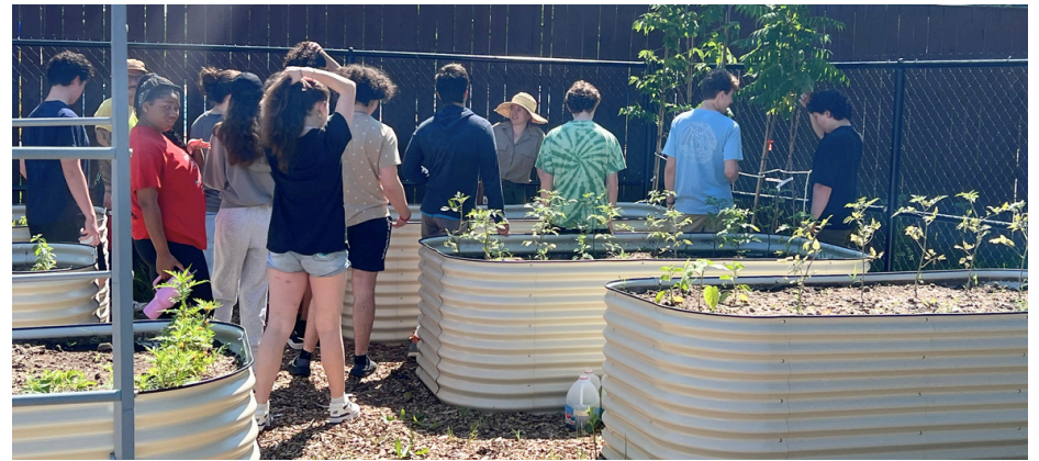
First group of students at the newly installed garden beds for the Native Americans of Maryland Program

We are excited to showcase the bounty of nature for you, both plant and fungal alike, and we can't wait to see you at Mount Rainier Nature Center this Fall.