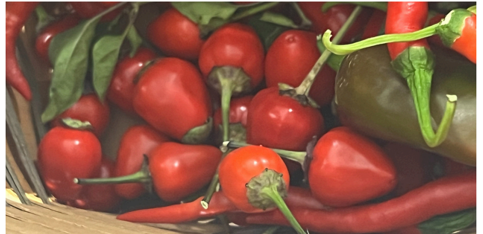
First flush of peppers harvested at MRNC